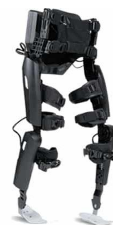
Figure 1. ReWalk