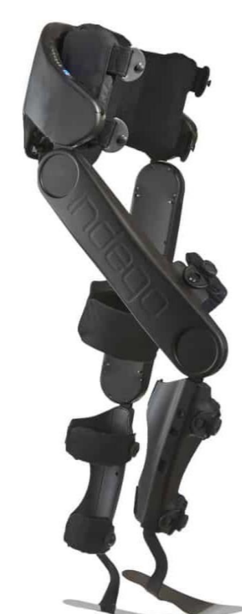
Figure 2. Indego